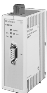
OZD FIP G3