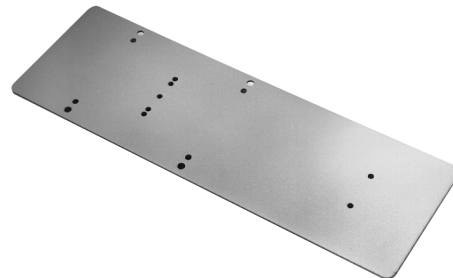
LL27M MOUNTING BRACKET FOR PT1200 SERIES PAN/TILT